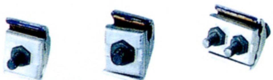
CU8-50 2 AL16-70 2 /12m 2